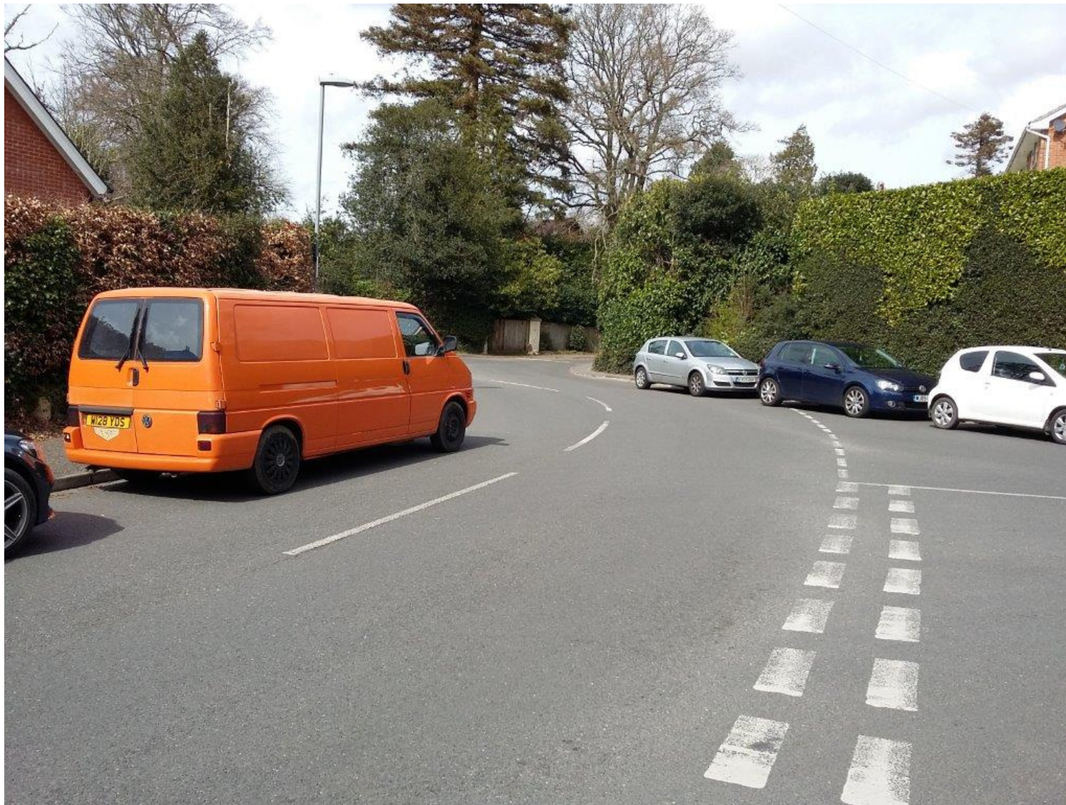
APPENDIX 2 another view looking northward from the junction of St Johns Hill with Cranfield Avenue towards the roundabout