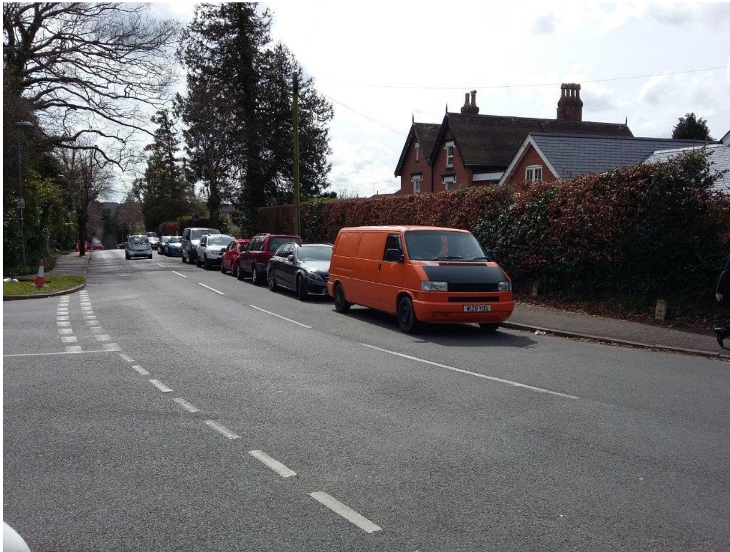
APPENDIX 2 View looking southward along St Johns Hill from the junction with Cranfield Avenue