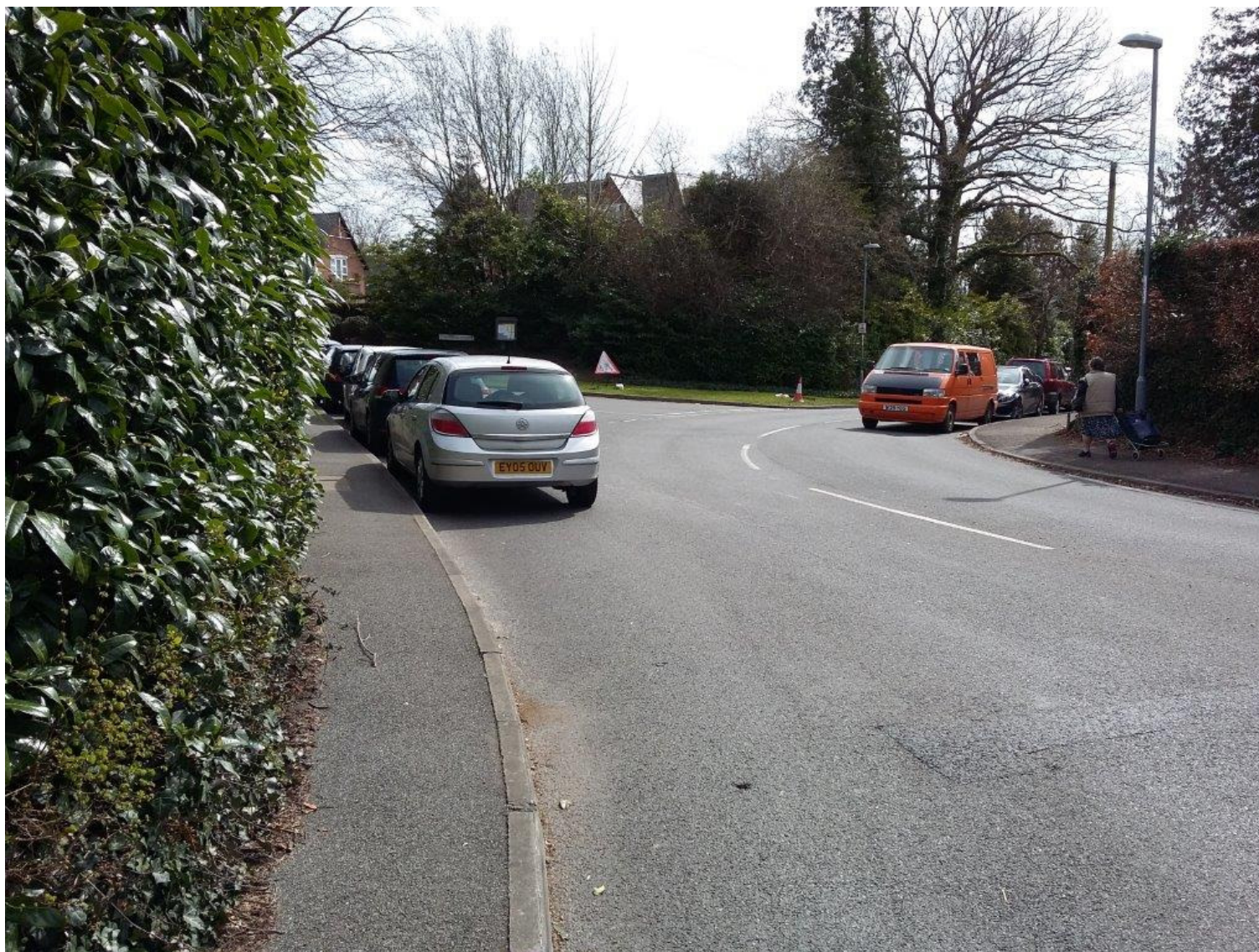
APPENDIX 2 View looking southward from the roundabout along St Johns Hill and the junction with Cranfield Avenue