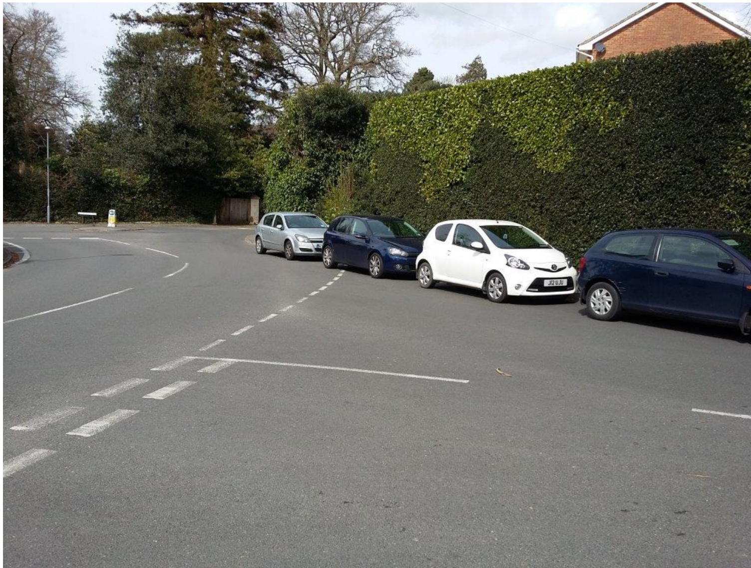
APPENDIX 2 View looking northward from the junction of St Johns Hill with Cranfield Avenue towards the roundabout